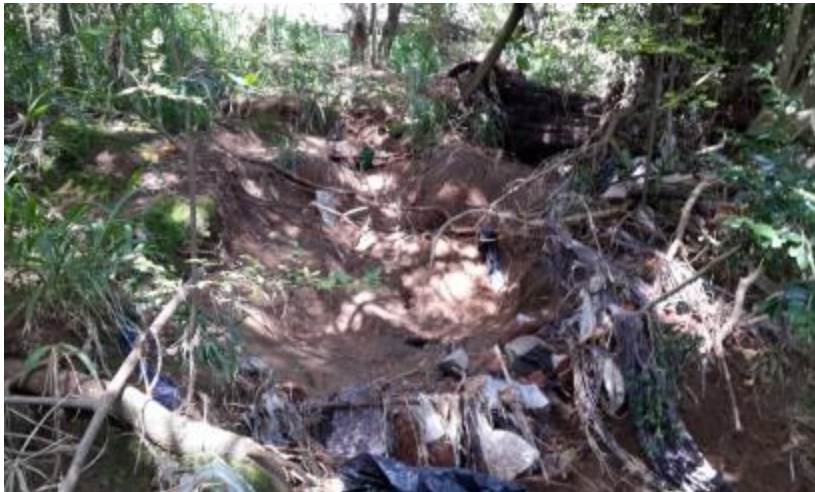
Pollution of Wolwespruit before and after clean up