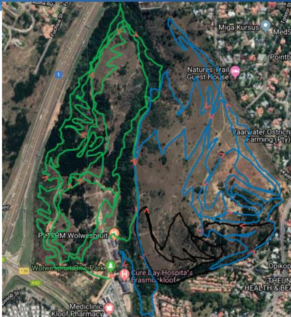
Wolwespruit MTB Trail Map